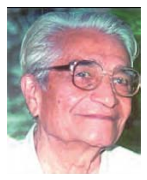
The Veteran NGO

If we look at our eternal resources the Panch Tatwa, The sun, air water soil and the space as true resources, managed responsibly by the community a new civilization can emerge. We create water security, food security and infused excellent sprit for future responsibility among our young generation through Rukmavati River Basin covering 46 villages and 70000 persons. We now have our earth as a good residence for all. But most important we are building a cohesive interacting community brotherhood